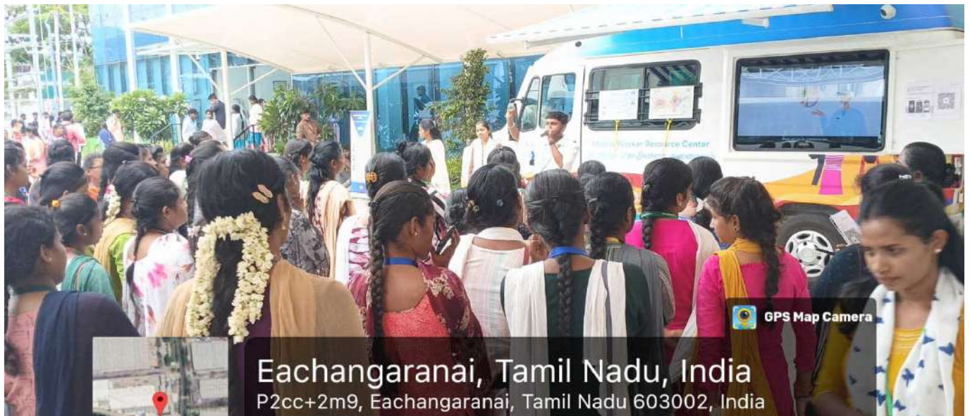
Eachangaranai, Tamil Nadu, India P2cc+2m9, Eachangaranai, Tamil Nadu 603002, India