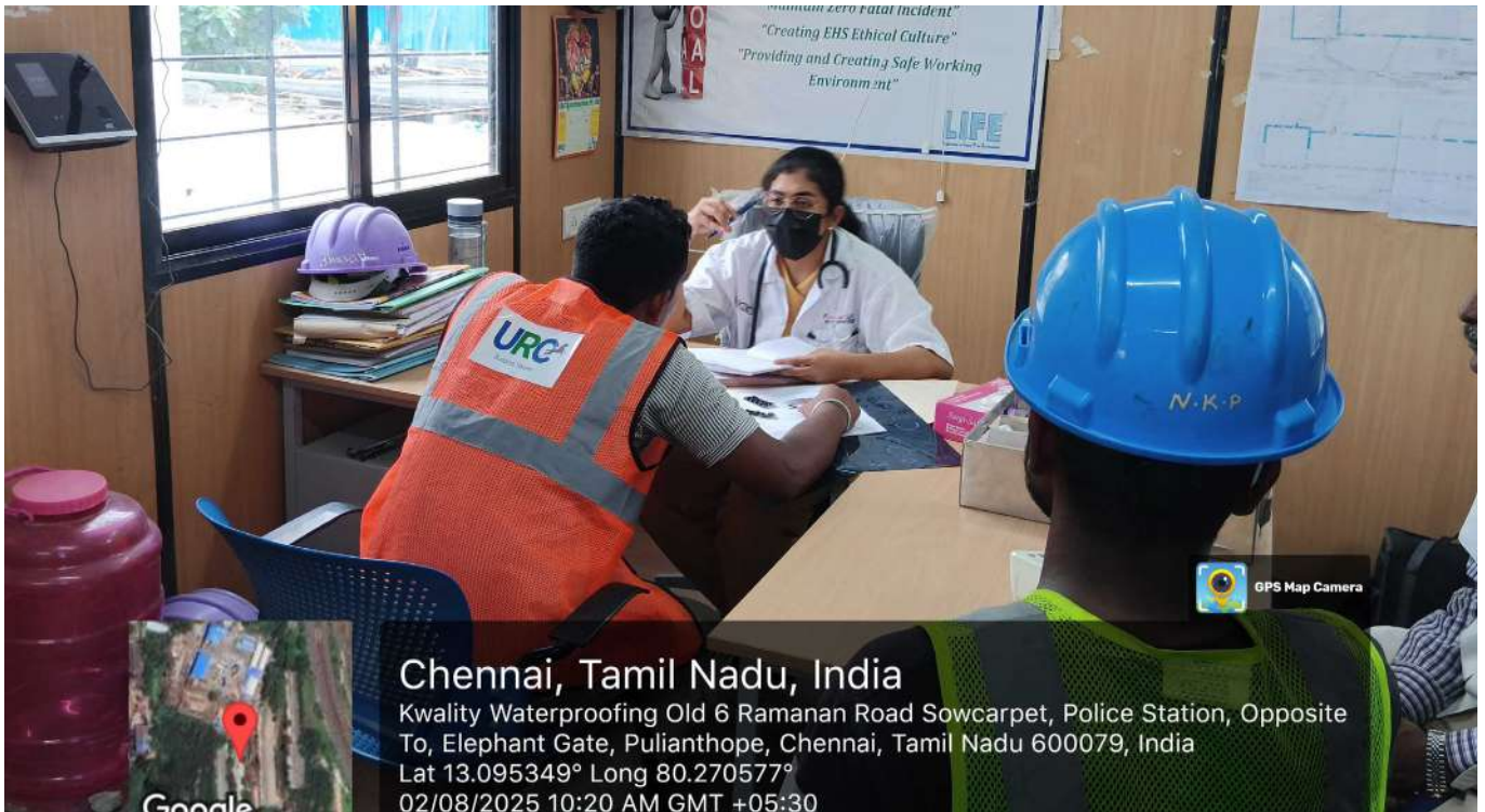
Chennai, Tamil Nadu, India

Kwality Waterproofing Old 6 Ramanan Road Sowcarpet, Police Station, Opposite To, Elephant Gate, Pulianthope, Chennai, Tamil Nadu 600079, India Lat 13.095349° Long 80.270577° 02/08/2025 10:20 AM GMT +05:30